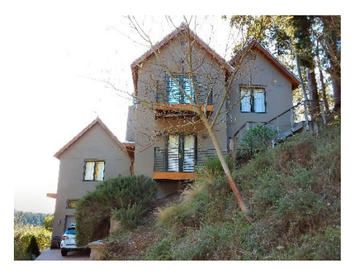
A. Stepping the building up or down the slope reduces its mass.