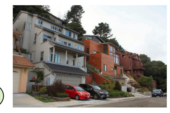
B. Not adequately stepping the building up the slope increases its mass.